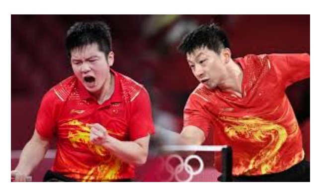
Figure 1. Ma Long and Fan Zhendong Gold Medal Match, Tokyo 2020

They are very successful in this. The sports men and women are also inspired to play; they are perhaps used to the system. China dominates several sports like Badminton, Diving etc. and Table Tennis is almost entirely an All China competition.