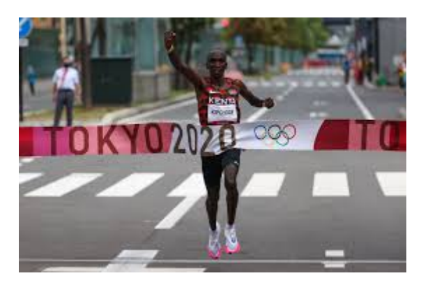
Figure 3. Gold Medalist Kenya's Kipchoge, Tokyo 2020

The worst examples are from the Middle East. It is known that when the Iraqi footballers used to return home defeated in a match, Saddam Hussein used to get them whipped. But by their standards, that is just mild treatment, at least he didn't dip them in acid; that probably is reserved for political opponents. India is quite a democratic country and do not push their populace in any direction whatsoever and even Bronze medalists are given heroes' welcome. In the rest of the world like Africa or Latin America, sports are individual inspired and not led or controlled by the state. Latin Americans produce some real good footballers and surfers. Africans do have incredible marathon runners though somewhat famished looking, as if running for food or money.