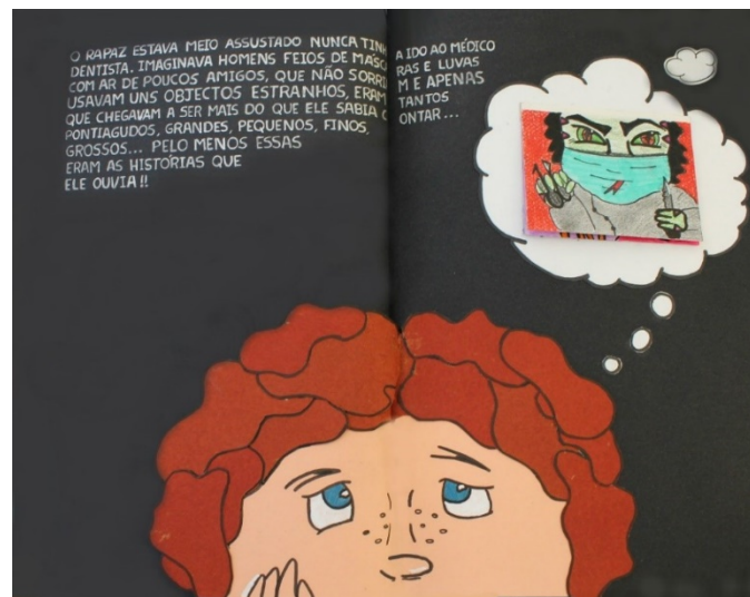
Figure 4. Handbook's 7th Panel Entitled "Dental Nightmares: Illustration of a Child's Fears Related to the Perception of the Dentist and of Dental Care Instruments"

In the handbook's fifth to tenth panels, "Bia", a secondary character, is introduced as a metaphorical proxy of the tongue. Bia represents the voice of reason and the moral of the story, narrating the attack operated by the Tooth Puller to the dental family (Figure 3) and emphasizing the role of cariogenic foods and poor oral hygiene in the destruction caused by dental caries. These panels attested to several passages of Simão's daily life, marked by the discomfort of dental pain, as well as by fear associated to the Paediatric Dentistry's appointment (Figure 4). The set of panels that depict the anxiogenic thoughts experienced by Simão, refer to the somewhat intimidating unconscious ideas of children regarding a therapeutic setting experienced as unsettling and threatening.