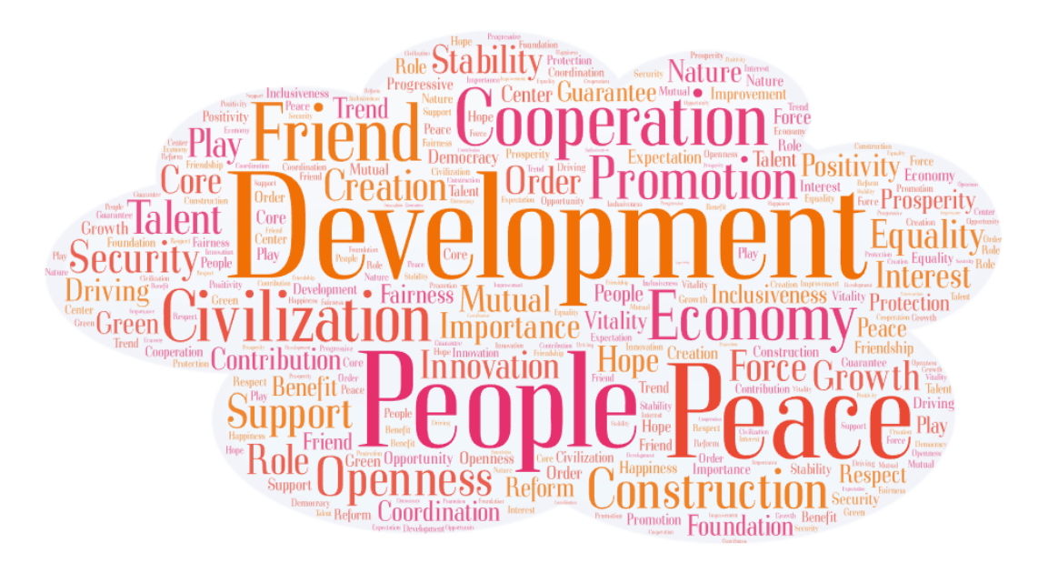
Figure 2. Positive Keyword Word Cloud

From Figure 2, it is evident that terms such as "development" (452 occurrences), "people" (249 occurrences), "cooperation" (155 occurrences), "civilization" (112 occurrences), and "peace" (107 occurrences) frequently appear. Among them, "development" unquestionably stands out as a central theme.