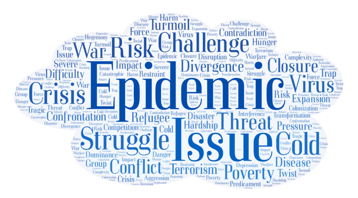
Figure 3. Negative Keyword Word Cloud

From Figure 2, it is evident that terms such as "development" (452 occurrences), "people" (249 occurrences), "cooperation" (155 occurrences), "civilization" (112 occurrences), and "peace" (107 occurrences) frequently appear. Among them, "development" unquestionably stands out as a central theme.