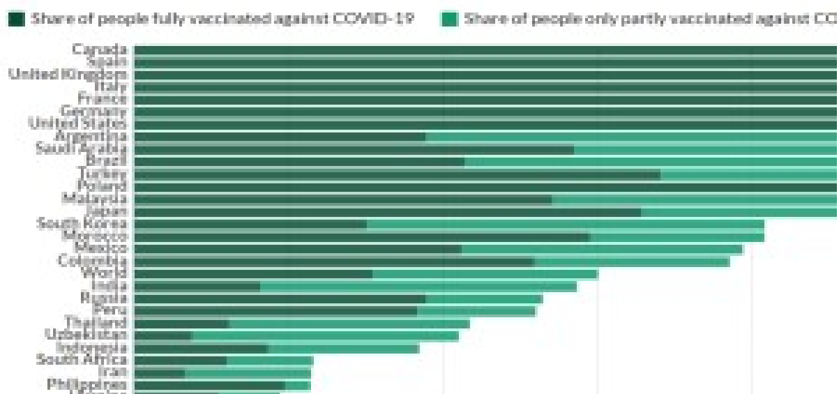
Figure 1. Share of People Vaccinated Against COVID-19. Aug 8, 2021

Figure 1 reveals the share of people vaccinated against COVID-19 as of August 8th 2021. As you can see from the table, the US ranks 6th on the list of countries with the highest vaccination rate. In the next section, we focus our attention on the types of vaccines available currently at various locations and their production.