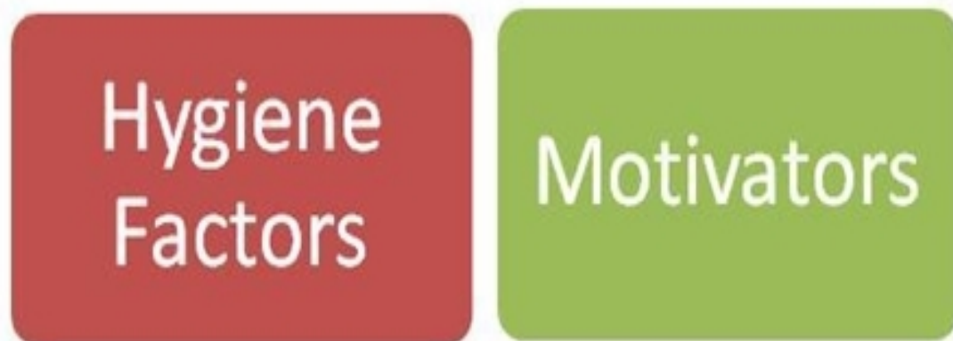
Figure 2. Herzberg's Two Factor Approach

Frederick Herzberg proposed this theory, It is also known as motivator-hygiene thesis as an alternative to Taylorism which showed concerns for the quality of working life of people in organizations. This theory implies that there are two different sets of factors, hygiene and motivators or satisfiers, which affect individual motivation and job satisfaction. Herzberg, discovered that there were certain factors associated with job satisfaction (motivation factors) which are those factors that are related to the content of one's job and are necessary to maintain a reasonable level of motivation among employees, such as the nature of the work itself, the possibility for growth, responsibility, advancement, recognition and status. A completely different set of factors are associated with dissatisfaction which are referred to as hygiene or maintenance factors. For instance, inadequate monthly salary to employees could cause dissatisfaction at work when hygiene factors are absent, for example, when good relations with supervisors and peers, good pay and working conditions, job security and among others are absent (Herzberg et al., 1959). However, a high salary would not necessarily cause job satisfaction. Herzberg's work challenged the central thesis of Taylorism that job satisfaction was one-dimensional, ranging along a continuum from satisfaction to dissatisfaction. Instead, Herzberg found motivation to be two-dimensional.