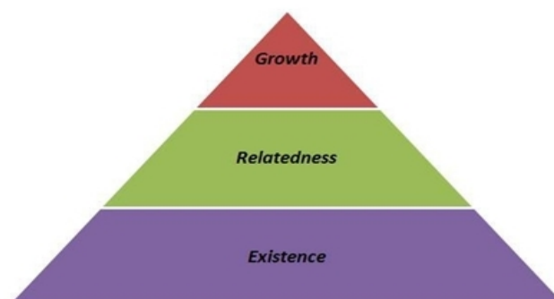
Figure 3. Alderfer's Erg Theory

He referred to as what impels a person to be creative or have an impact on his/her environment thus, the desire for personal development. He was of the opinion that this level of needs can be catered for by engaging in challenges that demands that you use your skills or require that you initiate new ones (Maslow's esteem need and self-actualisation).