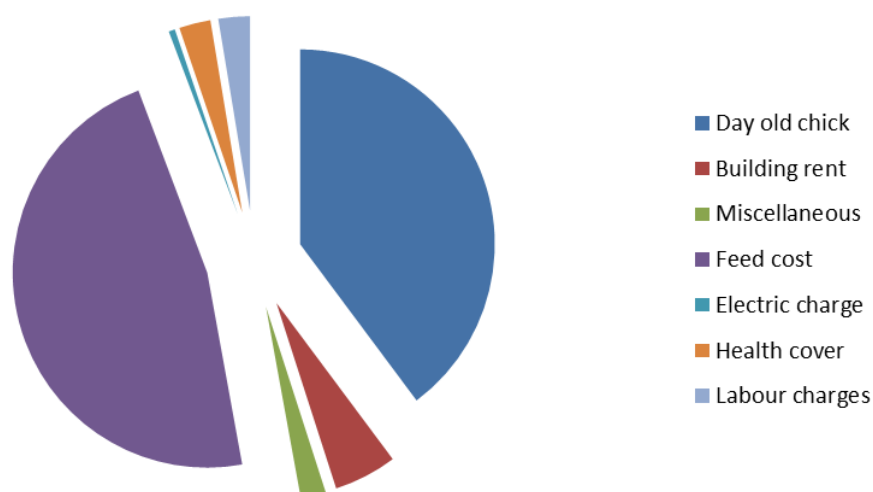
Figure 1. Cost of Per Chick Shown through Pie Chat