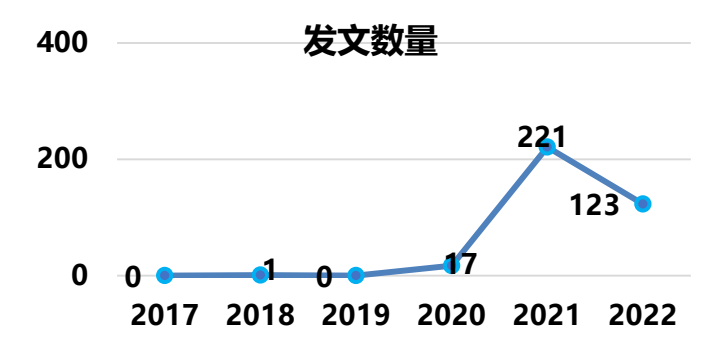
Figure 1. Annual Trends in Paper Publication

The statistical data of published journals are shown in Table 1, indicating that the topic involves multiple fields and multi-level publications. The journal with the highest publication volume is the core journal "Reference for Middle School Political Teaching", with a total of 12 articles, mainly studying the value, difficulties, and paths of integrating "Four Histories" education into ideological and political courses in universities; Next is "University", with 10 articles; Once again, there are 8 articles in "Beijing Education (Moral Education)"; Once again, there are 7 articles in the "Journal of College Counselors", including "Education Observation", "Education and Teaching Forum", "College Counselors", "Research on Ideological Education", etc., all with 5 articles published. There are also some unlisted journals, such as "Research on Ideological and Political Education", "China Higher Education", "People's Forum", and other related literature. In addition, each most college journals also publish 1 and 2 articles. This indicates that ideological and political workers in various universities are also actively paying attention to the integration of "Four Histories" education into ideological and political education teaching, and their theoretical research is emerging in a scattered form and constantly expanding.