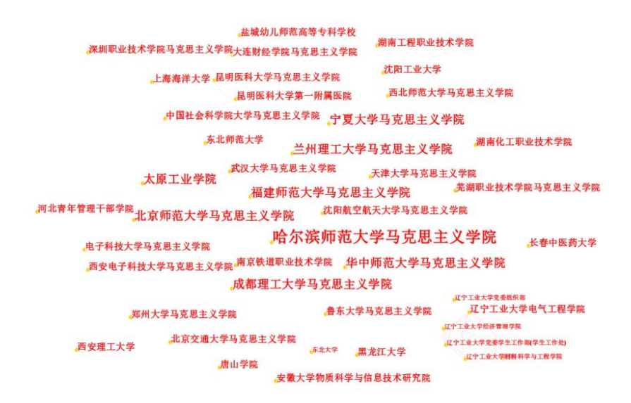
Figure 3. The Generated Keyword Co-occurrence Graph