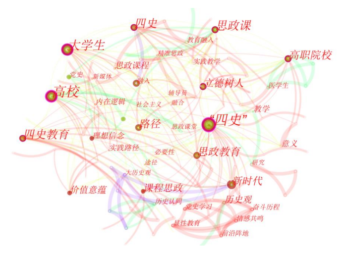
Figure 4. Keyword Co-occurrence Map of "Four Histories' Education"