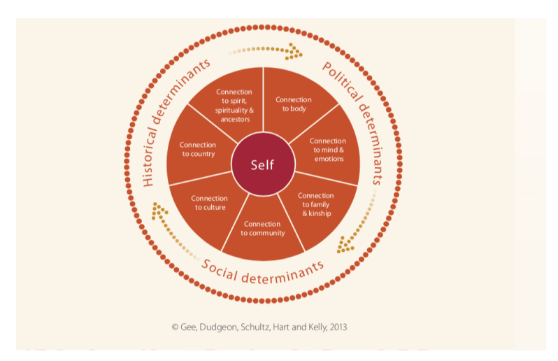
Figure 1. A Model of Social and Emotional Wellbeing