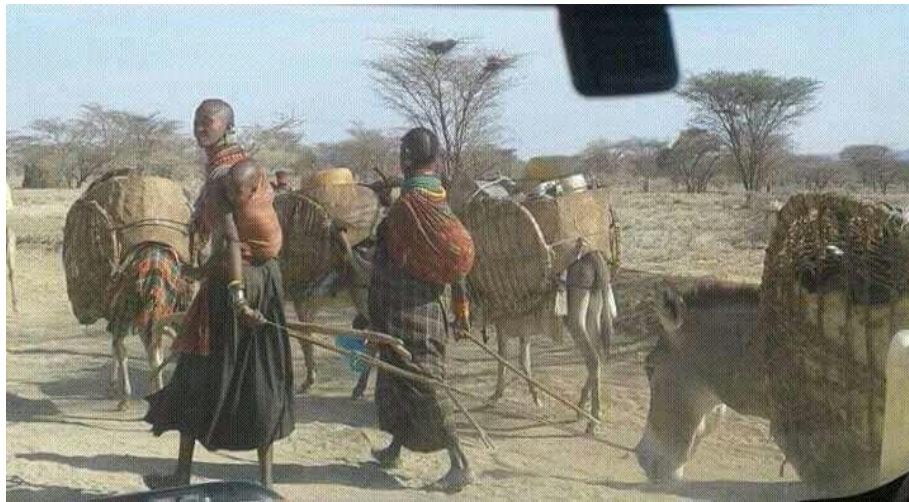
Figure 2. Observed Migration of Pastoralists in Napak, Ilemi Triangle, Turkana County, Kenya during Data Collection Period

Almost all respondents were Christians in Loruth (99%, 198) while a bigger margin of eighty two percent in Napak were Christians. About ninety five percent of nomads in Loruth receive water for their livestock from water pans and dams while in Napak a greater part of population use water from wells and boreholes.