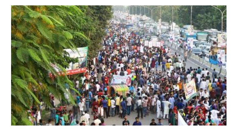
Figure 2. Violating Traffic Rules by Common People and as Consequences of This Is a Traffic Jam in Dhaka City