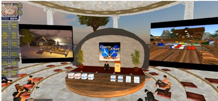
Figure 1. A Screenshot of the Cypris Chat in Second Life

The class was held in a computer-equipped classroom. There was a large whiteboard and a screen in front, connected to the lecturers' computer. The room was equipped with a surround sound system, a state of the art computer station and a projector. For the class, first, students were required to register on Second Life, and then to download and install it on each computer. After setting up Second Life, all the students joined the Cypris Chat ( http://maps.secondlife.com/secondlife/Wellston/166/87/23 ).