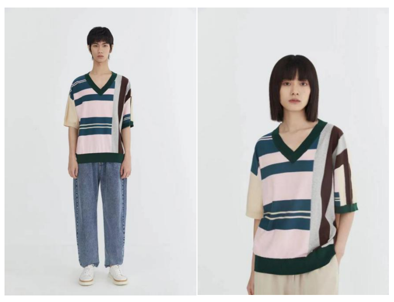
(Ishizukawa Bosie 2021SS series pictures from Bosie official WeChat)

Gender clothing symbol fusion processing referred to merging the element differences of each other in the design of men's and women's clothing, and looking for neutral element symbols to present. For example, in the color of traditional men's and women's clothing, black, white and gray were the main colors of men's clothing, which showed the calmness and seriousness of men; while women's clothing had no restrictions, and could be brightly colored to show women's sexy, lively, cute and other temperament. Genderless clothing blended bright warm tones with monotonous cool tones, and weakened them in terms of color purity. There was no obvious difference between men and women, and so as to achieve a sense of visual comfort. For example, the short and medium sleeved (Ishizukawa Bosie2021SS) series had a loose style and a triangular neckline design to meet the wearing needs of multiple genders. The horizontal stripes of different thicknesses and the combination of three colors were visually harmonious. Through the fuzzification or fusion of symbols, genderless clothing broke through the traditional stereotype of masculinity, broke the prejudice of "strong men and weak women", and became an effective way to construct a new concept of gender temperament and the equality development of multi-gender.