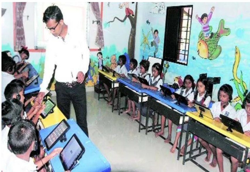
Figure 2. Maharashtra's First Digital Zilla Parishad School

Interactive teaching can only be successful when it meets the needs of full interaction, student's activities, sharing of personal experience and most important is feedback. The communication environment is created by receptivity, the teamwork of participants, the art of cooperation, mutual decision making and totality of knowledge. The teacher is the leader of any group and the teacher is the one who gives birth to new knowledge. If a teacher won't create an environment of curiosity among students, it can never lead to a successful interactive classroom. Interactive learning teaches with the help of real-life situations, role-plays, problem-solving worksheets, Ted-ex talks, Debates, etc.