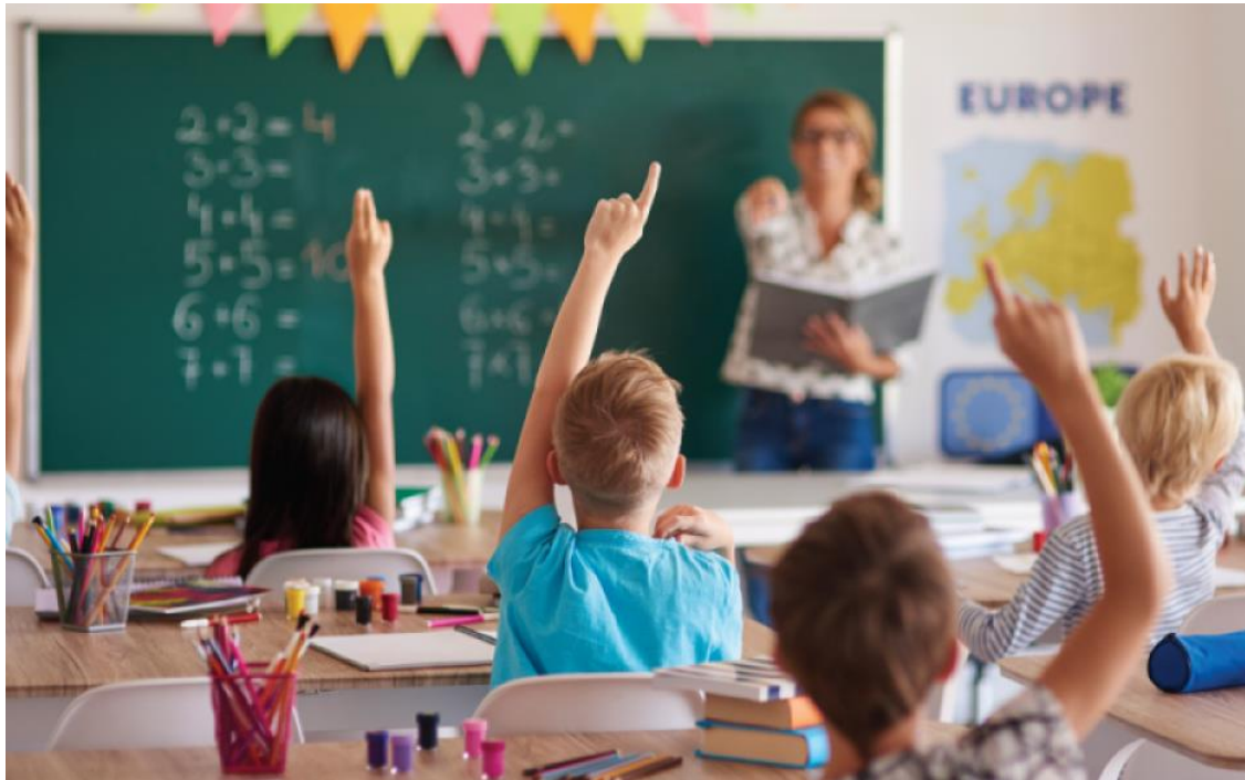
Figure 4. Interactive Teaching Classroom