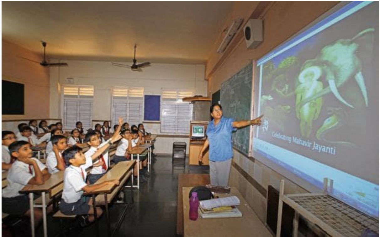
Figure 1. Teaching Students through Digital Classroom

smart and fast when it comes to using technologies. They know a-lot about technology than their parents. Interactive teaching can also be called the organization of cognitive ability. Interactive teaching is a productive learning process, in which the students learn by interaction. This is one of the best way to teach students about individual differences, when students sit together they will give their own opinion about any one topic and they will see how different things and different point of views comes out from different people. Interactive teaching also leads to the swapping of knowledge.