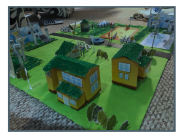
Figure 6. 3D Model of a Sustainable City