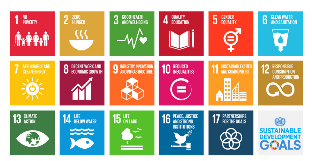
Figure 1. UN Sustainable Goals for the 2030 Agenda

The steps presented by Pedaste (2015) were followed to complete the inquiry cycle. As part of the orientation stage, students were presented with the United Nations 2030 Agenda. Teachers were in charge of introducing the goals, as shown in image 1, briefly describe what each objective was about and involve students in giving examples related to specific actions that could lead to meeting the objectives. After this, students were randomly divided in teams of 5 and one objective was assigned to each team.