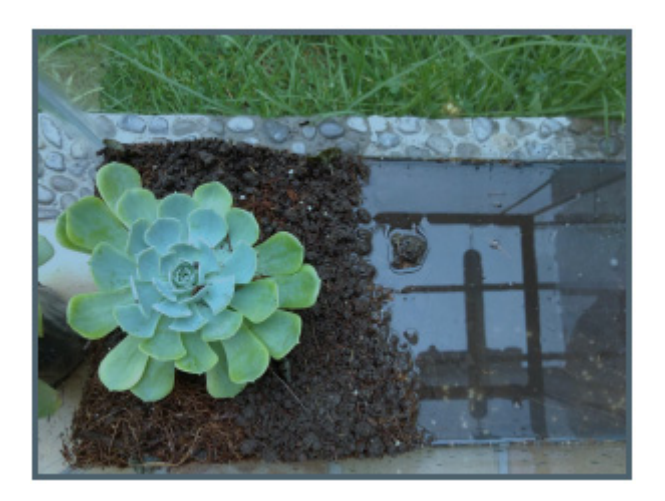
Figure 7. Plant Watered with Saline Solution

• It all adds up and Responsible consumption and production: These campaigns focused on educating people in the community in regards of buying common practices and the 5Rs. Both teams conducted a survey to find out about the usage of plastic bags, garbage separation and disposal, recycling and common pollutants. An infograph and a presentation were created to raise awareness of how to reduce the ecological footprint.