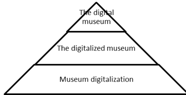
Figure 2. The Relationship of the Three Terms