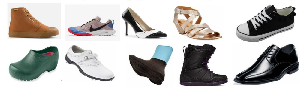
Below are sample concordance lines using "shoes" as the search word:

Interpret concordance lines using "shoes, boots or sandals..." as the search word on the platform and describe the following pictures with proper footwear terminologies in both Chinese and English.