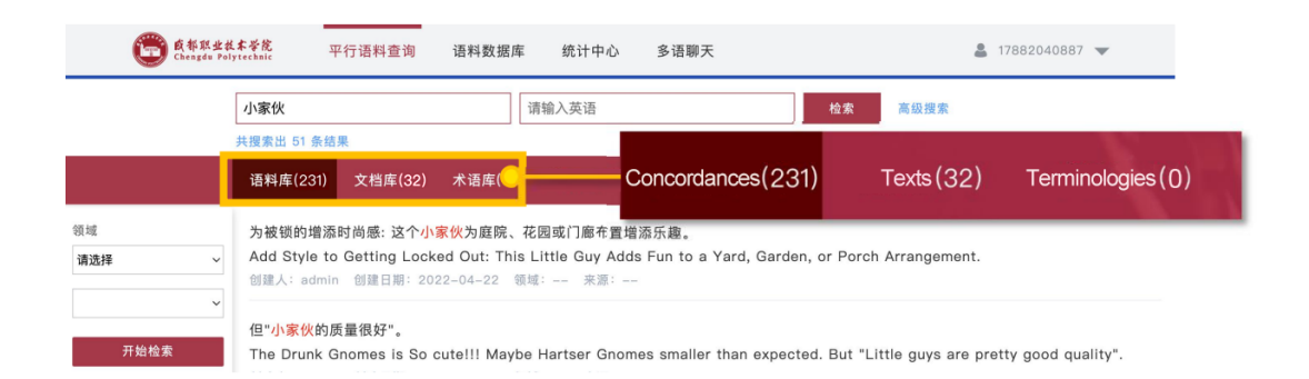
Figure 1. Query Function of the Corpus Learning Platform

(1) Queries can be performed in both Chinese and English, and the results are shown in terms of concordances, texts and terminologies to suit learners' needs (see Figure 1).