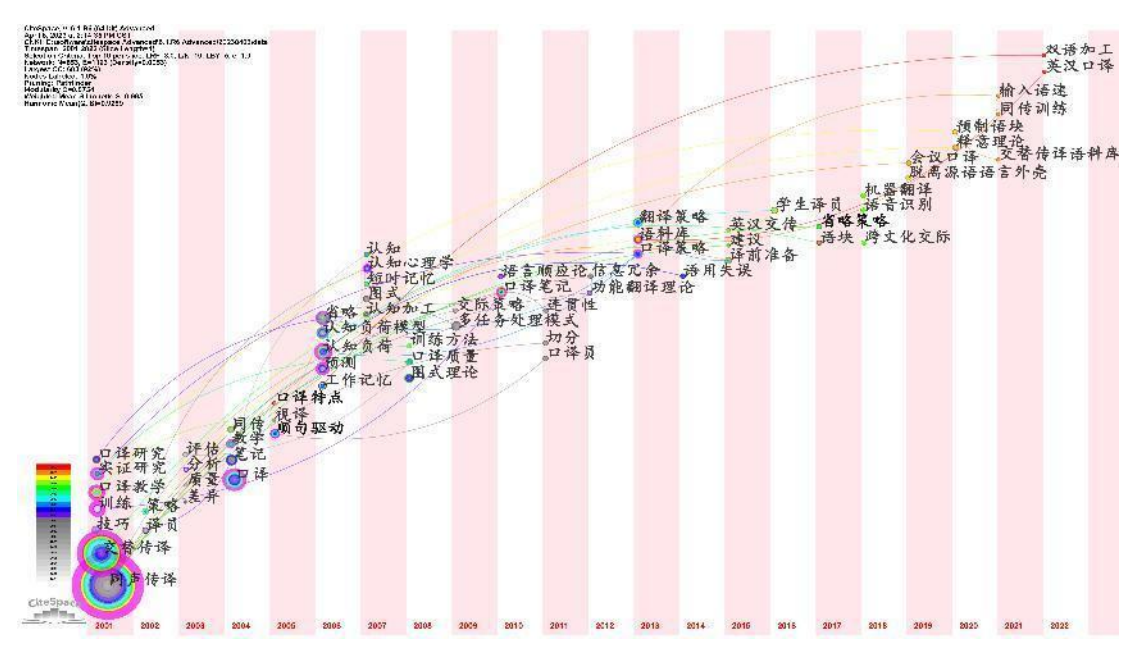
Figure 3. Keywords Co-occurrence Timezone Graph

As shown in Figure 3, the study of interpretation in China from 2001 to 2022 has the following characteristics: Since 2001, China has conducted a series of studies on "simultaneous interpretation" and "consecutive interpretation". With the increasing international communication, simultaneous interpretation began to develop professionally (Lu, 2022). Simultaneous interpretation is an important form of interpretation, and its research results are quite rich. For example, Mu and Wang summarized the articles on interpretation published in China in recent 30 years, and analyzed the number, topics and methods of domestic interpretation research. The paper mentioned that the research on interpretation in China is developing in the trend of diversification of topics, concretization of contents, interdisciplinary research approaches, marketization of orientation, and internationalization of communication. The main problems are weak discipline theoretical awareness and lack of scientific research methods, which can be improved by expanding research topics, improving research methods, and advocating interdisciplinary research.