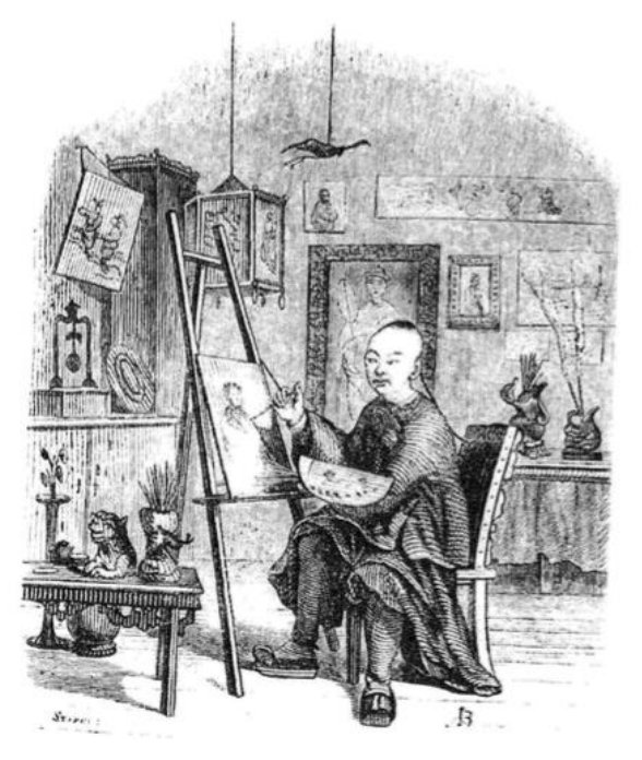
Figure 2. Engraving after Auguste Borget, Lamqua in His Canton Studio Published in La Chine Ouverte, 1845