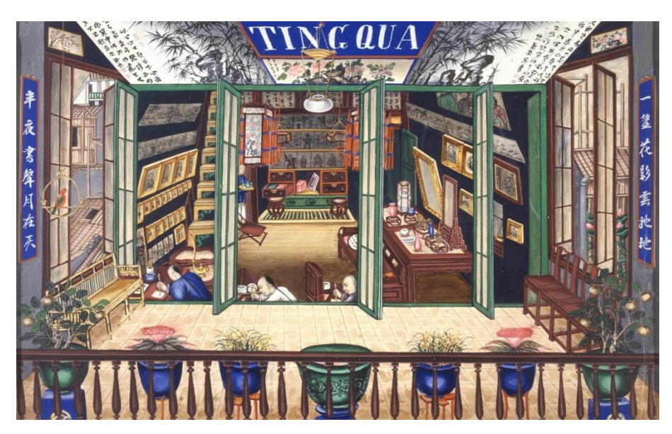
Figure 3. Studio of Tingqua, Canton, 1830, Gouache on Paper. Inv. AE85592. Collection of Peabody Essex Museum of Salem

In addition to adopting new techniques, the pigments used in export paintings were introduced from European and American countries, including gouache, watercolor and oil paint. However, most watercolor export paintings were created on pith paper, a unique material derived from the tongcao plant, a shrub found in China's southern provinces. Unlike common papers made from plant pulp, pith paper (Figure 4), was produced by cutting long, continuous sheets from pith rods obtained from the plant's stems and branches (Kr üger, 2019, p. 5).