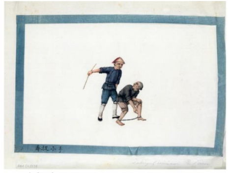
奉捉小手 Catching pickpockets on order