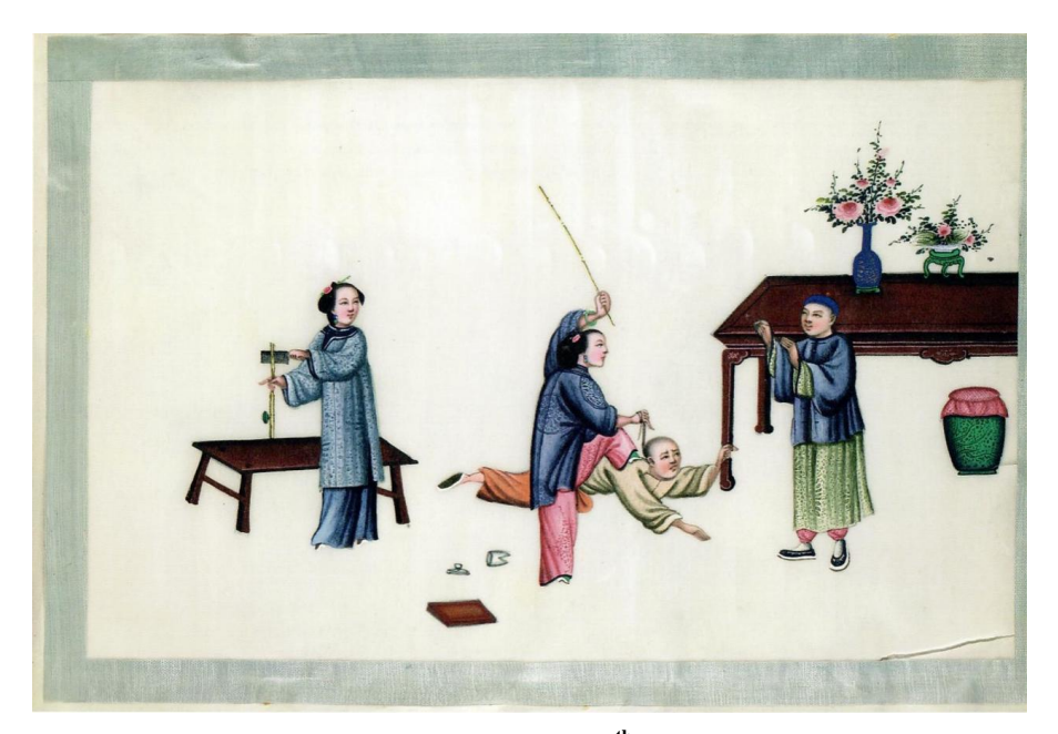
Figure 7. Mother Caning Smoker Son in Anger, Late 19<sup>th</sup> Century, Watercolour on Pith Paper, H: 35.1cm, W: 23.2cm. The British Library