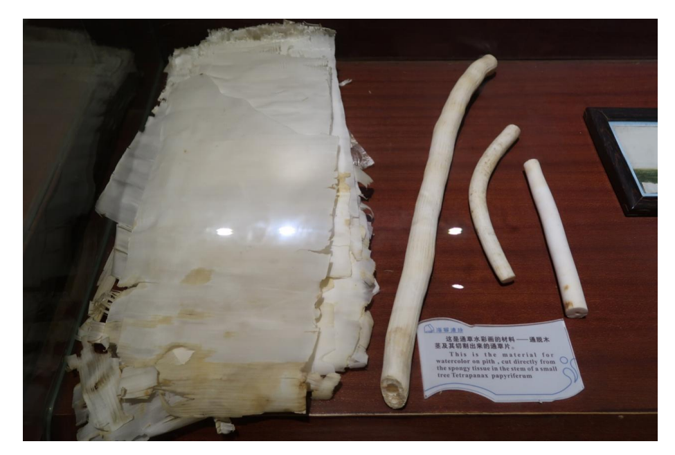
Figure 4. Extracted Pith Rods (Right) and Freshly Cut, Untreated Pith Paper (Left). Guangzhou Museum, Guangzhou, China.

In addition to adopting new techniques, the pigments used in export paintings were introduced from European and American countries, including gouache, watercolor and oil paint. However, most watercolor export paintings were created on pith paper, a unique material derived from the tongcao plant, a shrub found in China's southern provinces. Unlike common papers made from plant pulp, pith paper (Figure 4), was produced by cutting long, continuous sheets from pith rods obtained from the plant's stems and branches (Kr üger, 2019, p. 5).