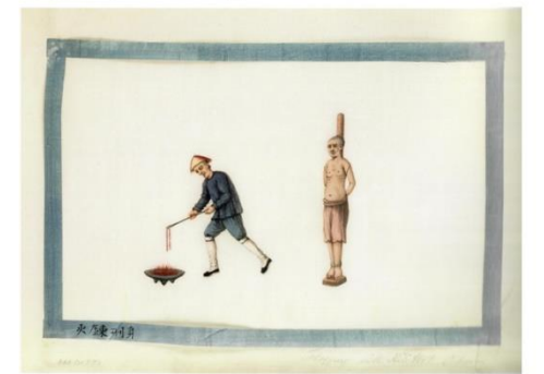
火鍊刑身 Punishment with a red hot chain