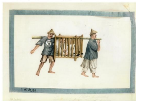
上囚赴解 Carting the prisoner to a certain place

Figure 6. Paintings of Punishments, 19<sup>th</sup> Century, Watercolour on Pith Paper, H: 19.5cm, W: 30cm. The British Library