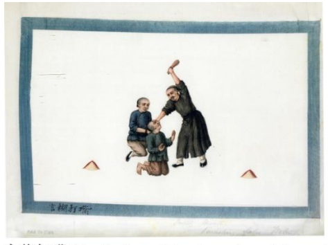
言糊打嘴 Mouth slapped due to unclear statement