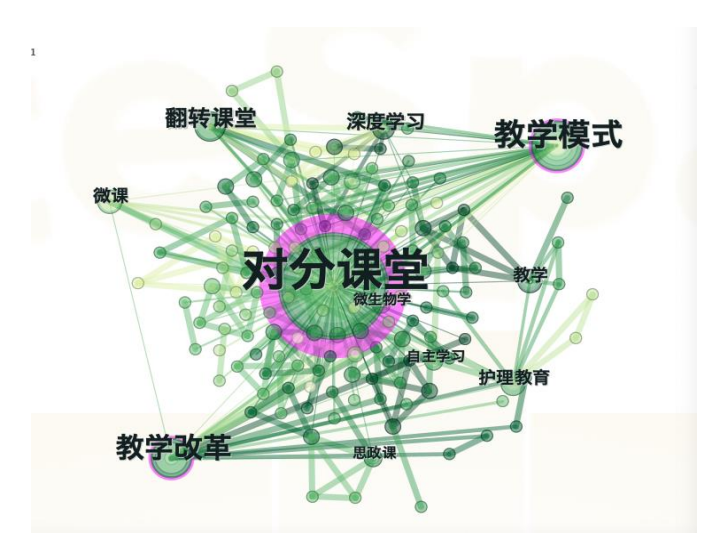
Figure 3. PAD Class Keyword Co-Occurrence Map