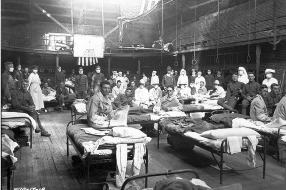
Image 1. University of Kentucky Gymnasium during 1918 Influenza Pandemic.

While not delineated in this manner, the literature suggests an effective response system requires four basic capabilities that will be referred to as: