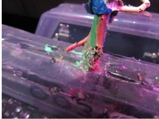
Figure 6. Photograph Revealing Cord Damage on Panel S/N 3A

investigation (including photovoltaic testing using the apparatus shown in Figure 8) and determined that a corroded wire (Figure 6) was the root cause of the observed failure. The wire was exposed, due to a wire shielding flaw during manufacturing (Figure 7) and acted like a wick during the moisture duration tests. Improved manufacturing processes and use of more robust components will prevent similar future failures.