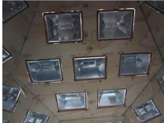
Figure 8. Photograph of the Solar Roadway Panel Solar Tester