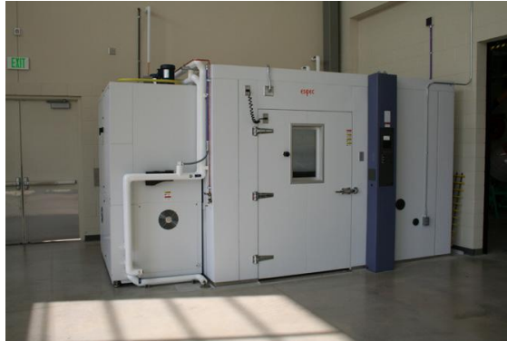
Figure 4. Walk-in Sized, ESPEC Temperature and Humidity-Controlled Room for Freeze/Thaw and Moisture Conditioning Testing

environmental chamber shown in Figure 4.