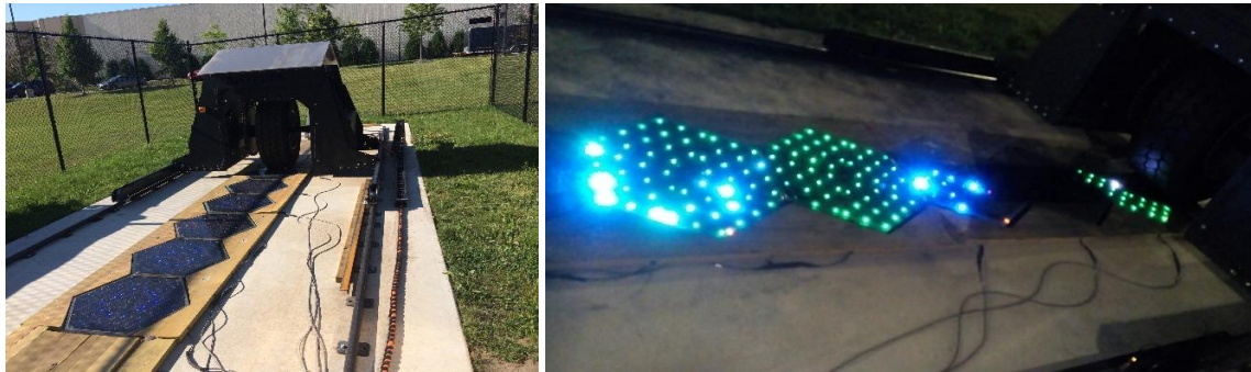
Figure 9. Light Emitting Diode Status a) on 9 July 2018 (S/N's 015A-015F Depicted from Front to Back) and b) on 18 September 2018 (S/N's 015A-015F Depicted from Left to Right)

approximately two hours of paver power or color reset. Approximately one-third of the LEDs in pavers 015D and 015F remained operational. LED status is depicted on Figure 9.