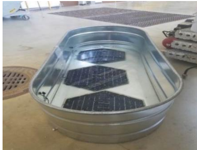
Figure 2. Single 300-Gallon Aluminum Container Used during the SRP Moisture Conditioning Duration Testing. The Paver Electrical Connectors Were Fixed above the Waterline during Testing

was exerted on each of the pavers throughout testing. Figure 2 illustrates paver position and spacing in the tank. Also shown in Figure 3 is the wire and connector placement above the waterline during testing.