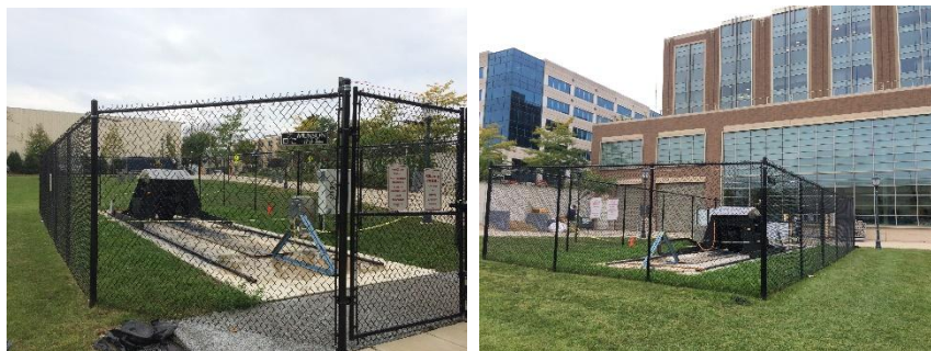
Figure 5. Heavy Vehicle Simulation (HVS) Test Facility Located at Marquette University

The Heavy Vehicle Simulation (HVS) test was conducted to investigate the mechanical properties and evaluate LED operation of the SRPs. The testing was performed in accordance with recognized industry standard practices for paved surfaces. Testing was performed on the MU campus in the SR Pilot Project area located on the south side of Engineering Hall as shown in Figure 5. Limited electrical testing was accomplished to verify paver operation before and during HVS testing and consisted of verifying LED operation.