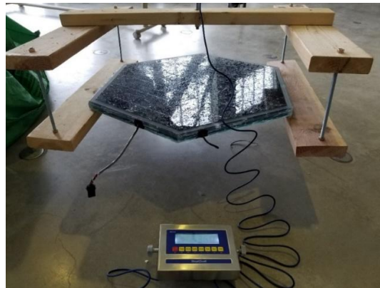
Figure 3. Test Apparatus for Weighing the SRPs before and after each Moisture Conditioning Test

Figure 3 shows the weigh system used for the SRPs.