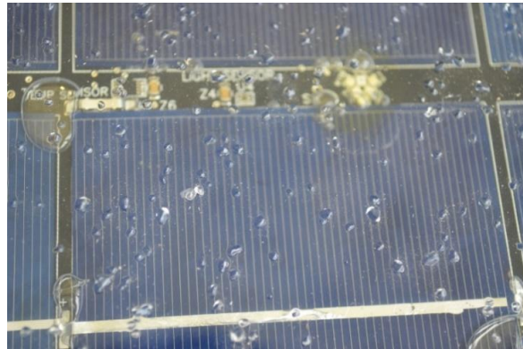
Figure 7. Example Panel Variations due to Manufacturing Process (i.e., Internal in-Polymer “Bubble” Formation)

The wires were cleaned/repared and then LED functionality and photovoltaic tests were conducted on all three panels at the SR facility. Figure 8 shows the underside of the SR solar tester. It contains seven 500W lamps for a total of 3500W. The entire apparatus was placed on top of a single Solar Roadway panel during testing and the results are provided in Table 1.