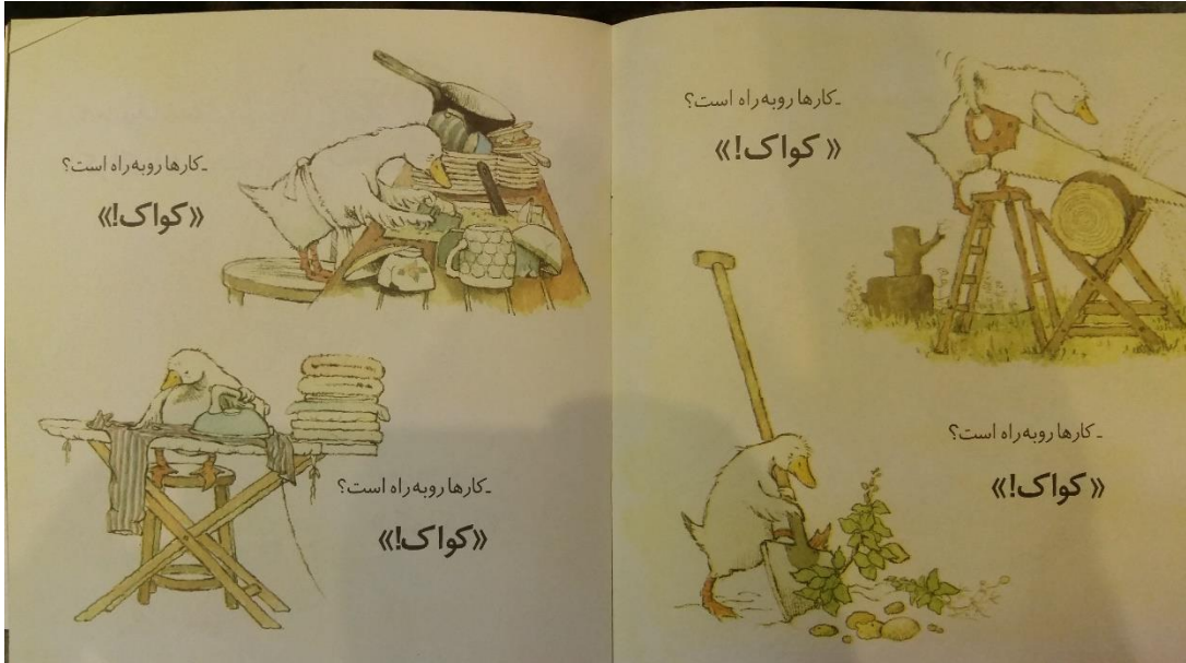
Figure 2. Farmer Duck