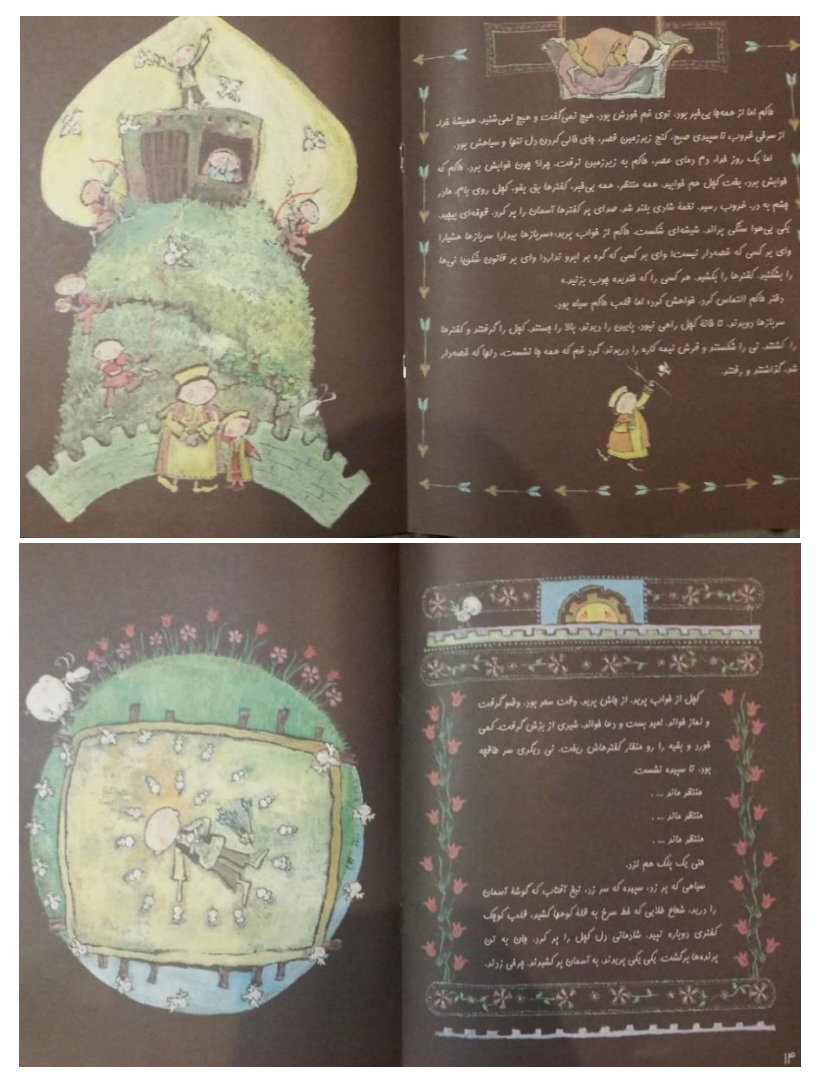
Figure 1. The Legend of Bald Birdman

These two pictures are taken from The legend of bald birdman.