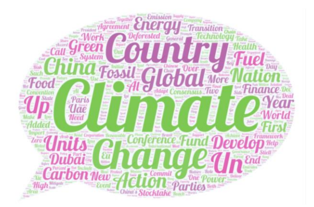
Figure 2. The Overall High-frequency Word Cloud

High-frequency keywords can aid in fostering comprehension of the primary subjects covered in news discourses as well as the methods by which attitudinal resources are implemented, in addition to the distribution of attitudinal resources generally. The overall high-frequency word cloud of the gathered corpus is displayed in Figure 2, from which the primary subjects covered in the news report may be easily extracted.