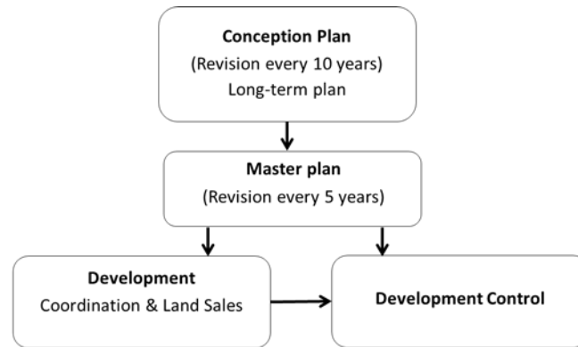
Figure 10. Singapore's City Planning

Source: Adapted from Director Agriculture, Natural Resource and Environment Planning Office (ANEEO), 2014, p. 13.