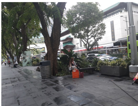
Figure 2. Characteristics of Trash in Singapore