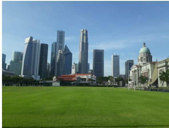
Figure 9. The Open Space to Create Beautiful Scenery for the City and Surrounding Areas

2) The open spaces of the city were designed as the courtyards with materials that are hardscape and softscape. With the use of open spaces for a variety of purposes or blending together. For example, to be the basin drainage areas, the urban recreation or activity areas, or to create a beautiful scenery for the city and surrounding areas, etc.