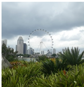
Figure 8. The Garden by the Bay