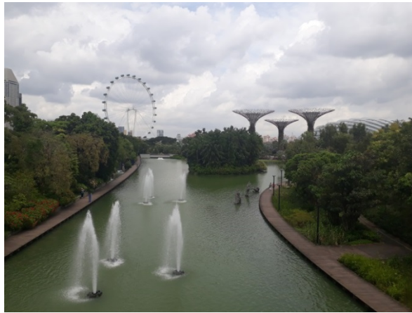
Figure 7. The Garden by the Bay

4) The garden models were created to increase green spaces and to be the recreation areas for the people. Including, to be an important tourist destination in the country, such as the Garden by the Bay.