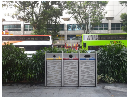
Figure 1. Characteristics of Trash in Singapore

3) There are garbage dump spots throughout the city. Convenient to use, the condition is clean, neat, beautiful, not destroying the scenery of the city.