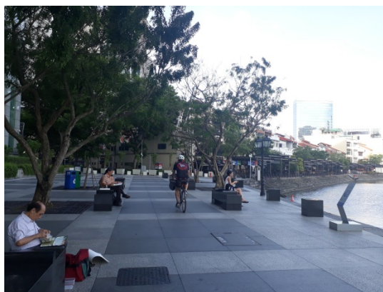
Figure 5. Places for Doing Activities for Urban People

2) Water storage areas, such as Marina Barrage that is not only a large freshwater dam but also serves as a water barrier to prevent flooding when the tidal bore occurs. It was also designed to be a