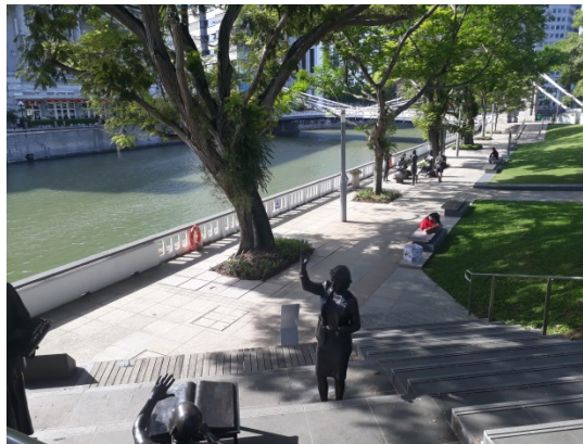
Figure 4. Along the Rivers

1) Along the rivers, such as the Singapore River, Calang River, Serangoon River, or other canals. The surrounding areas were designed to look like public parks along the riversides, mainly used the large perennials for providing shades. Using sculptures that convey various stories, including street furniture, such as benches, lamps, signs in many spots. Those areas are for a recreation, meeting areas, landmark areas, tourism areas. Including being places for doing activities for urban people, such as drawing, exercising, cycling, and etc.