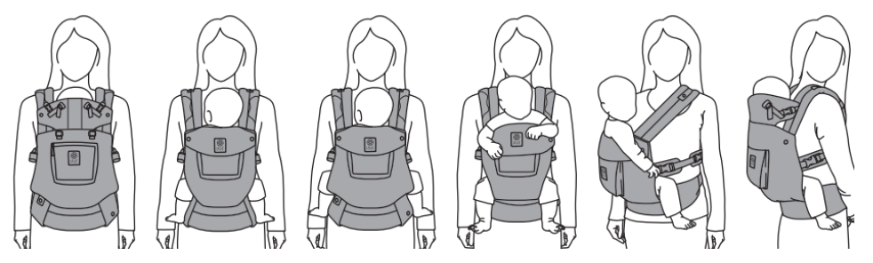
Figure 2. 6 Position Baby Carriers as a Basic Knowledge of Ancient Egypt