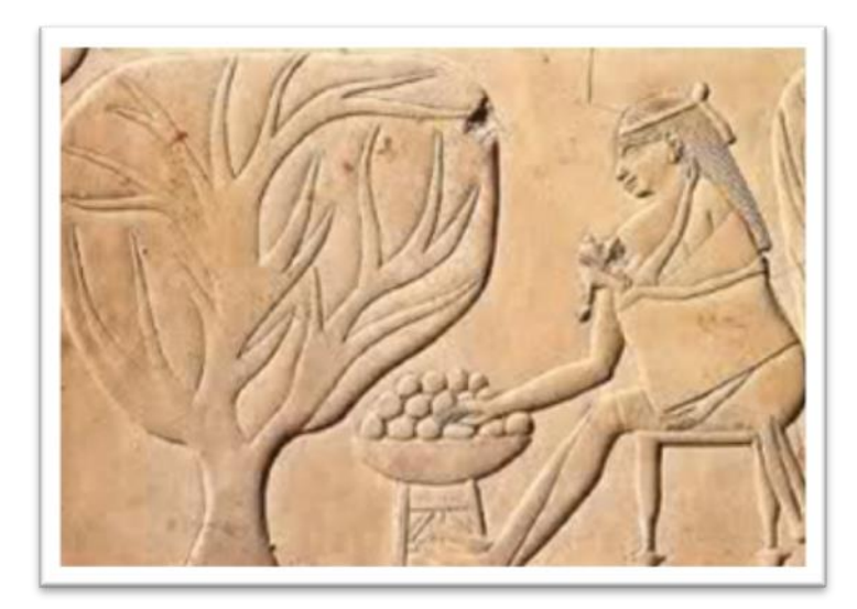
Figure 1. Back Baby Carriers in Ancient Egypt